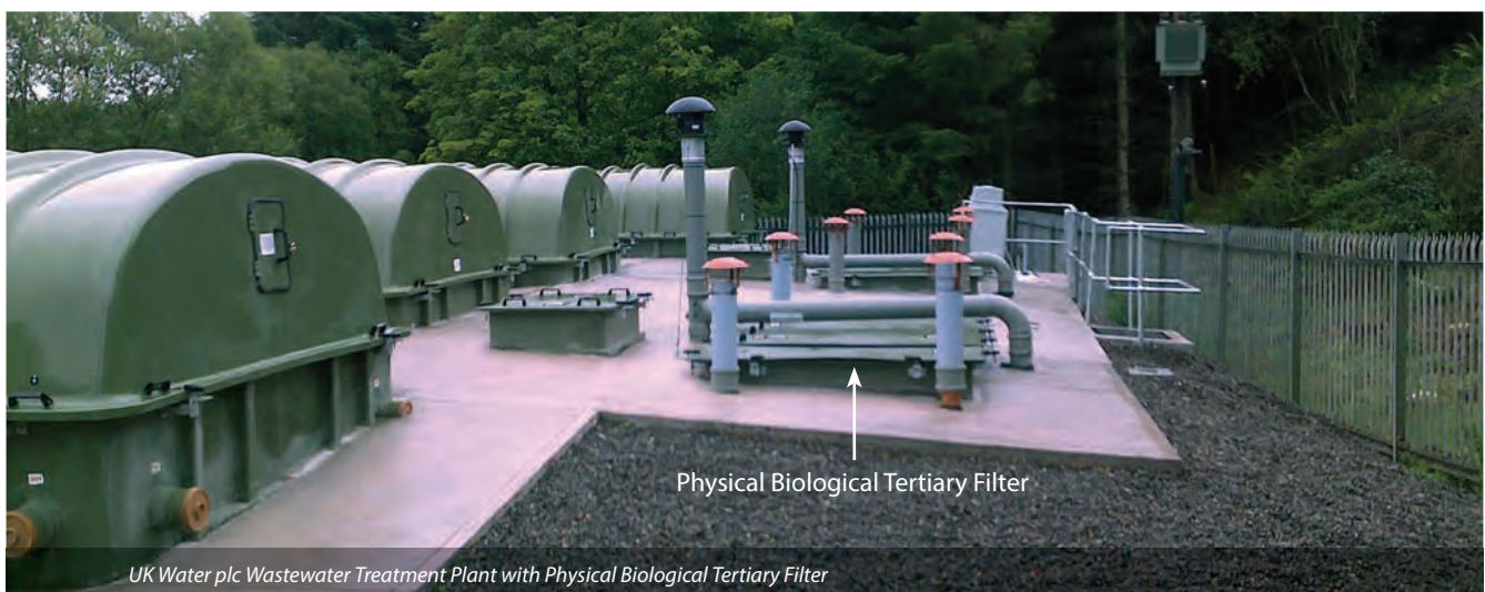
UK Water plc Wastewater Treatment Plant with Physical Biological Tertiary Filter

Most major wastewater facilities for towns and cities now include biological nutrient removal as a matter of course. With large plants, where operational resource is easier to justify, and where the plant has qualified operators with laboratory and all the operational resource, it is easier to ensure that the plant is operated within design parameters for biological nutrient removal. When the nutrient removal becomes a requirement for small plants in rural communities, the operational resources normally available at large wastewater treatment facilities become difficult to justify. The need to contain energy costs and the associated carbon footprint is top of the agenda with most clients and utility companies; therefore the rural wastewater treatment works needs to be designed to perform with minimal labour input, power consumption and other operational costs.